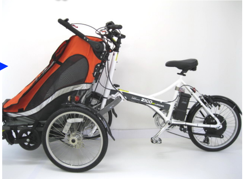
e-ZIGO LEADER 【TTF COMPLETE】

Electric-powered in line with the laws of Japan is very difficult. However we have the technology along the laws and regulations only in Japan.