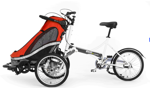
ZIGO LEADER made in USA