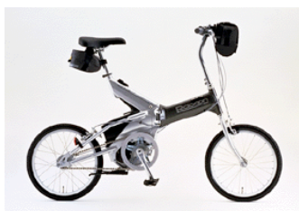
HONDA RACCOON COMPO 1998.3 Released

Almost all of bicycle shop in Japan ordinary repaired the motor unit by sending to the makers, but we can repair it of Japan all manufacturers on ourselves. Several makers appreciate our technical capabilities, they served a special maintenance manual to us.